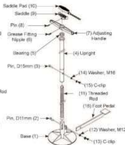
Figure 2 - Model MPS1500PA Components